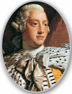
HM George III Truefitt's first Royal Patron

The story of the Oldest Barbershop in the World, as recognised by Guinness Book of World Records in April 2000, began in fashionable Mayfair in 1805, the year of Nelson's victorious Battle at Cape Trafalgar, while King George III sat on England's throne and William Pitt the Younger served as its Prime Minister. This was the era of fine craftsmanship, innovation and styling which set the scene for a history that is colourful, inventive and pioneering.