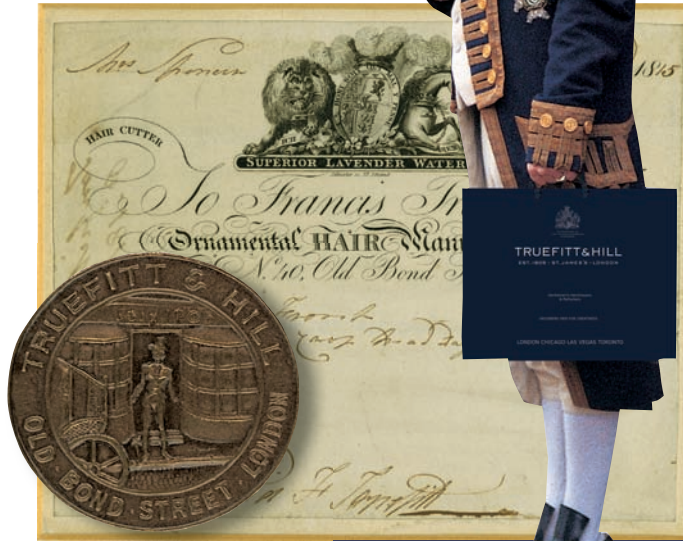
Truefitt's seal circa 1920s